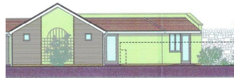
: Elevation to Garden.