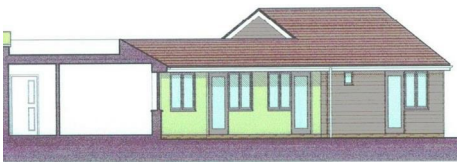
North East Sectional Elevation.