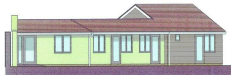
East Elevation to Entrance.